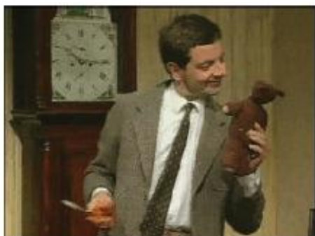
A world renowned tv/film/cartoon/book/theatrical character