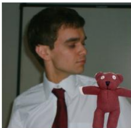
Clumsy, quiet slap stick genius