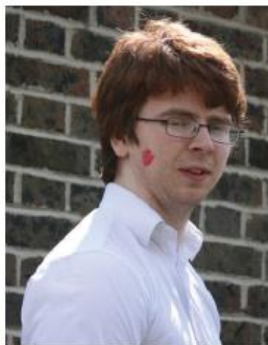
Overly confident, man of mystery